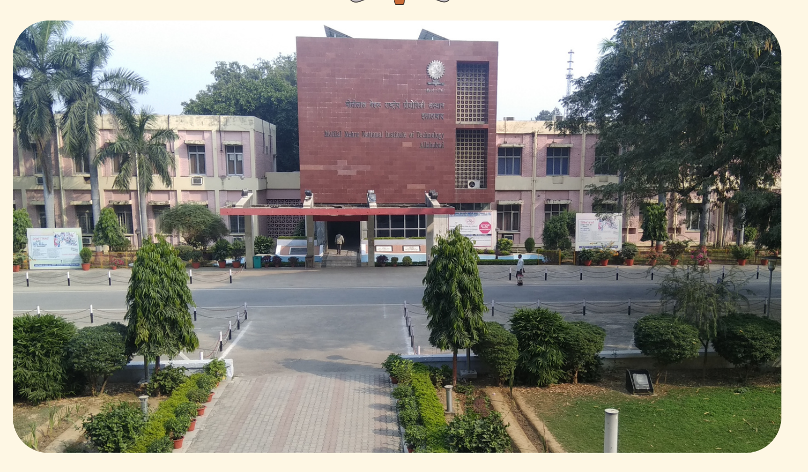
Organized by: School of Management Studies Motilal Nehru National Institute of Technology Allahabad, Prayagraj- 211004 (India)