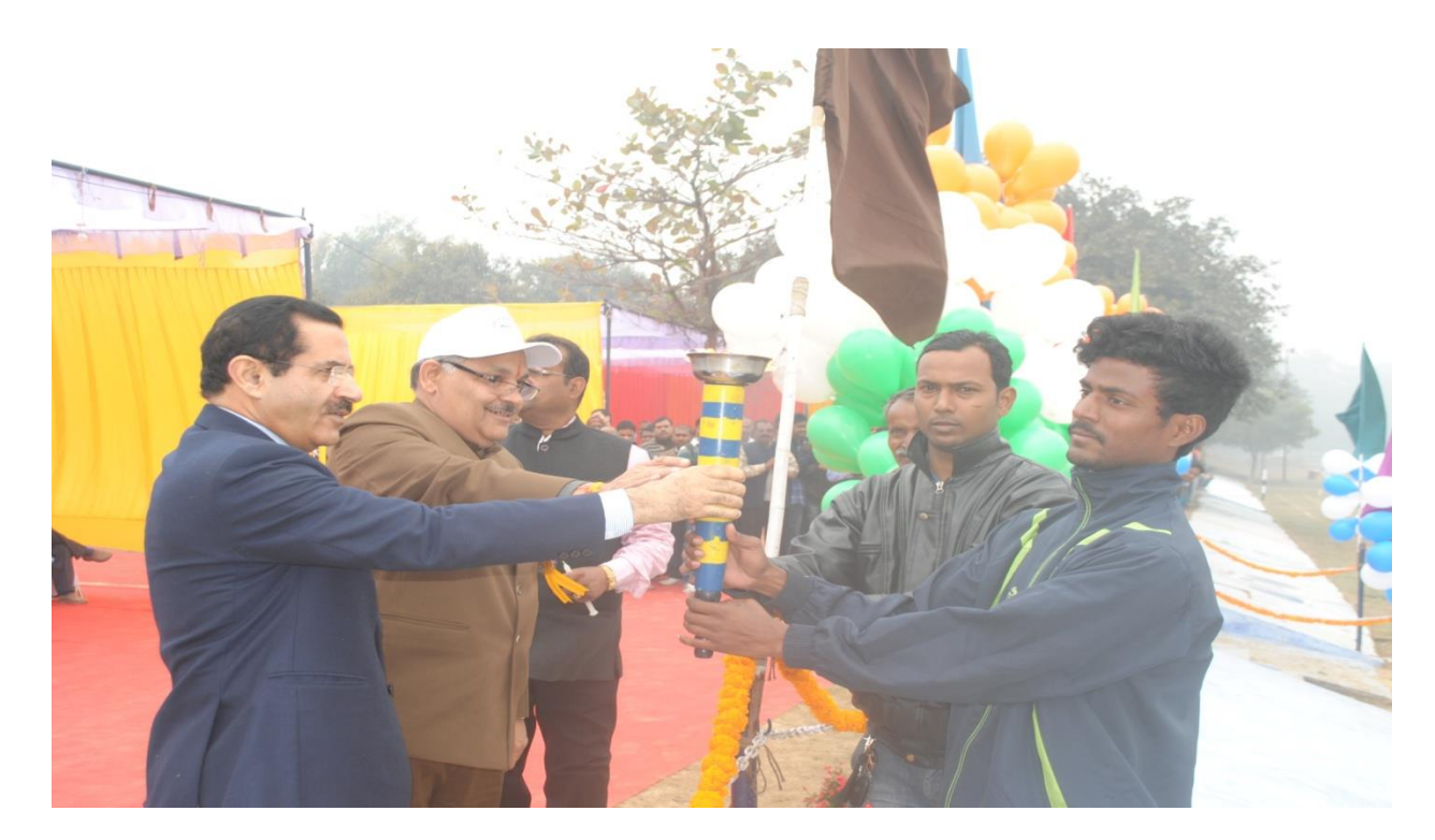
50th Annual Athletic Meet