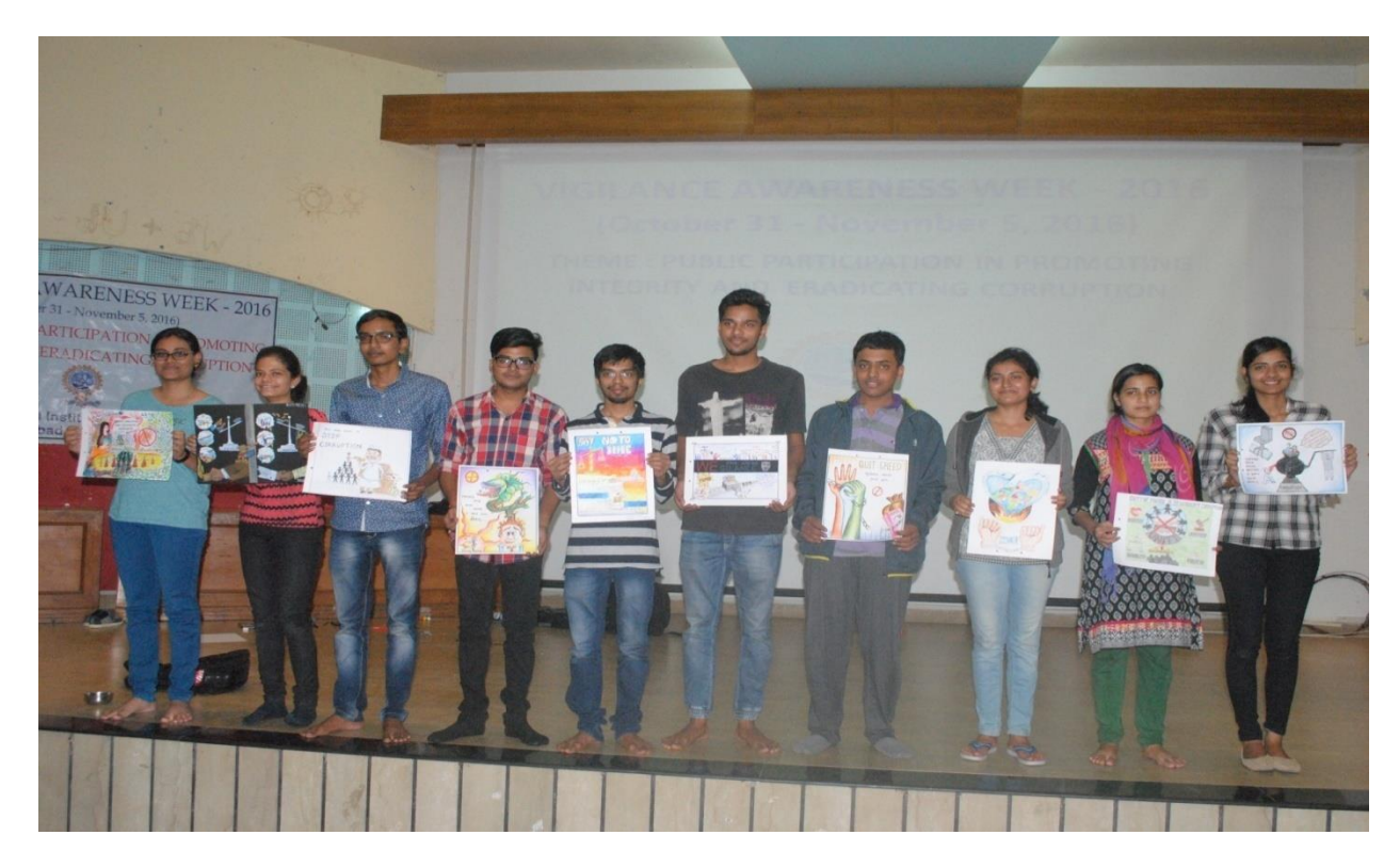
Vigilance Awareness Week