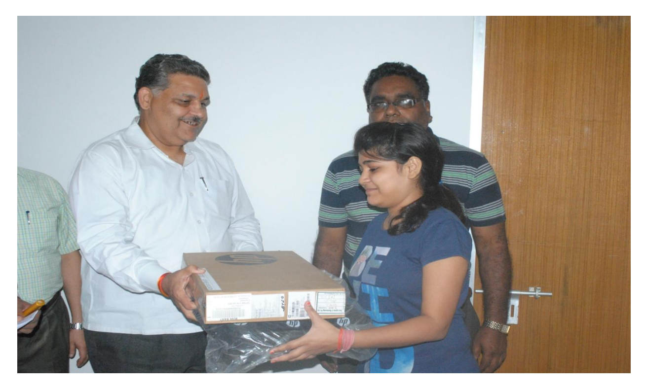
SC/ST Student Laptop Distribution