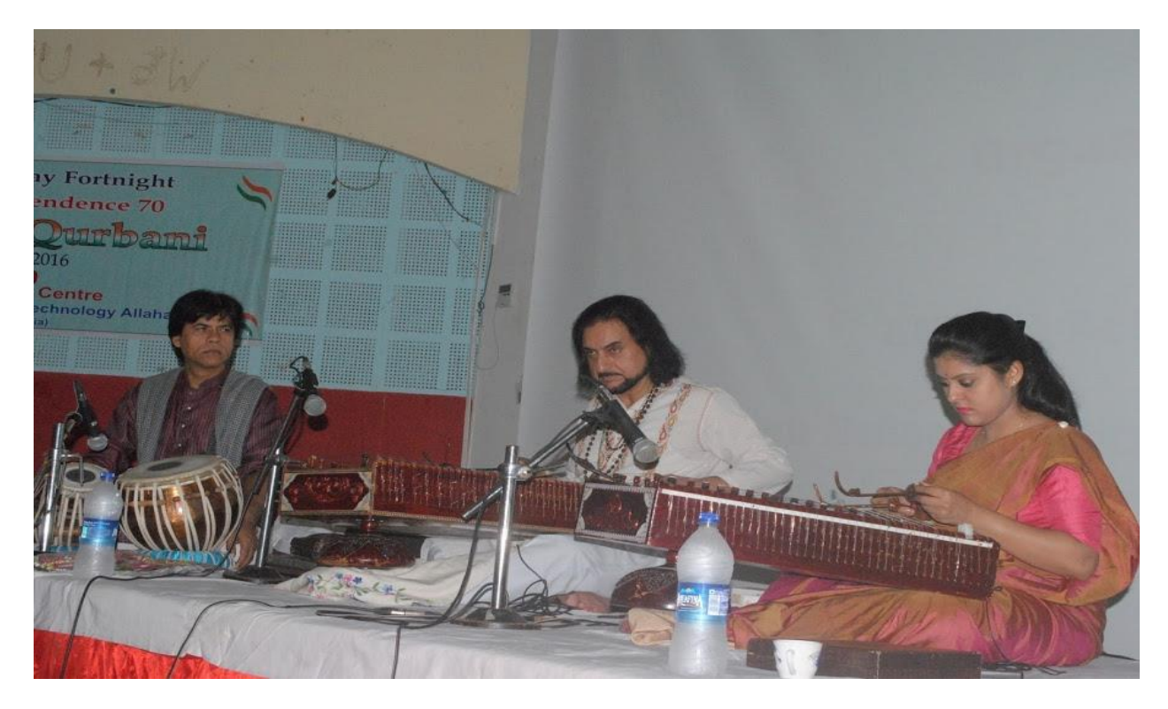
Spic Macay Event